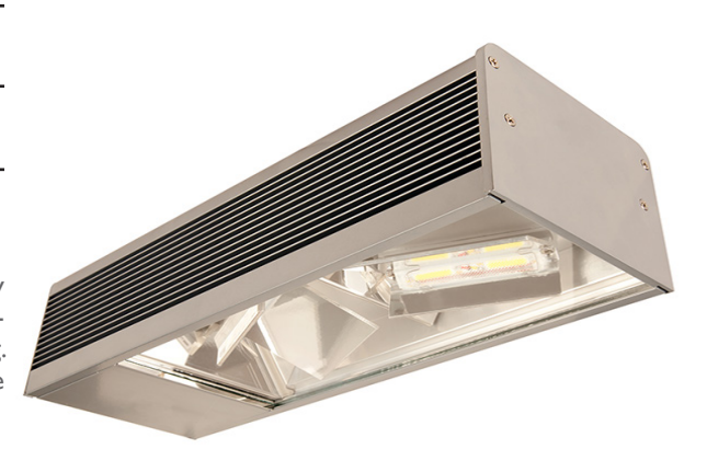
TWL Series Trail Light

Applications include: Trails, Walkway and Pathway Lighting